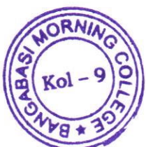
Teacher in Charge Signature

Bangabasi Morning College Kolkata - 700 009